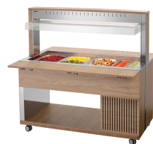
▶ Buffet cart for cold food