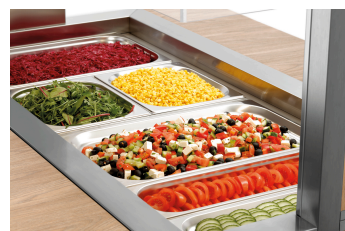
▶ Designed for: