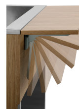
▶ With tray slide